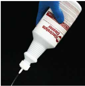
SQUIRT Onto grout lines, toilets, urinals, and sinks to remove rust stain, efflorescence, and mineral deposits