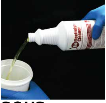
POUR Into drain lines to restore