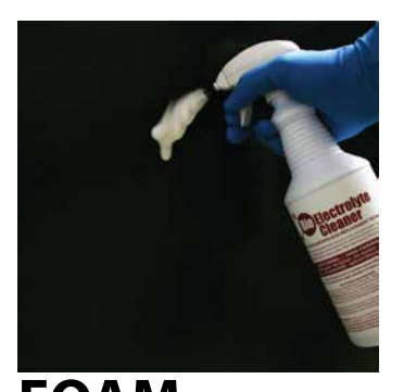
FOAM Onto vertical surfaces such as cooling tower fill, glass, and brick to remove rust, oxidation, and water spots