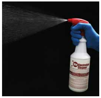
SPRAY Onto any glass, fabric, wood, concrete, brick, plastic, and most painted surfaces for general descaling